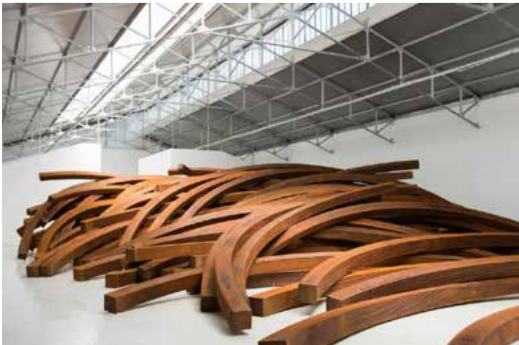
Bernar Venet, Effondrement: Arcs, 2016 von Bartha, Courtesy the artist and the gallery